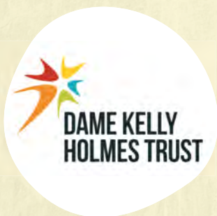
DAME KELLY HOLMES TRUST