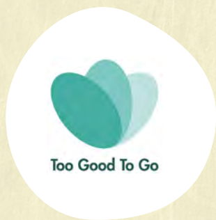
Too Good To Go